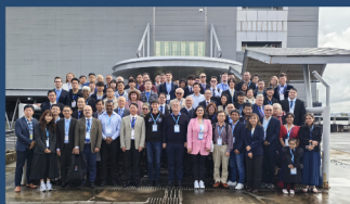
CECNet 2024 in Matsue

CECNet has attracted over 3,000 participants from around the world and resulted in more than 3,000 proceeding papers indexed by EI and Scopus. Additionally, over 500 papers have been recommended for publication in SCI/EI indexed journals.