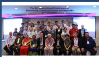
CECNet 2018 in Bangkok