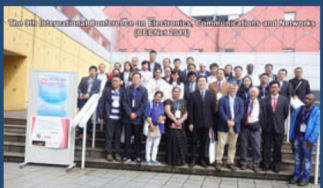
CECNet 2019 in Kitakyushu City