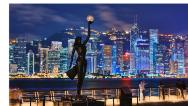
Avenue of Stars

Hong Kong is a highly prosperous free port and an international metropolis. It is a place where Chinese and Western cultures blend, offers an unparalleled culinary scene and picturesque landscapes.