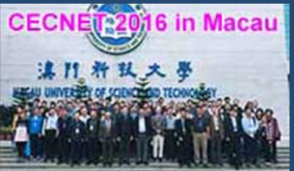
CECNet 2016 in Macau