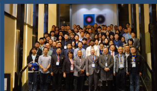
CECNet 2023 in Macau