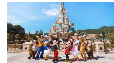
Hong Kong Disneyland