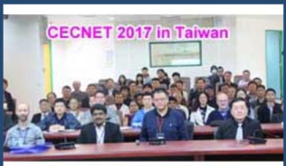
CECNet 2017 in Taiwan